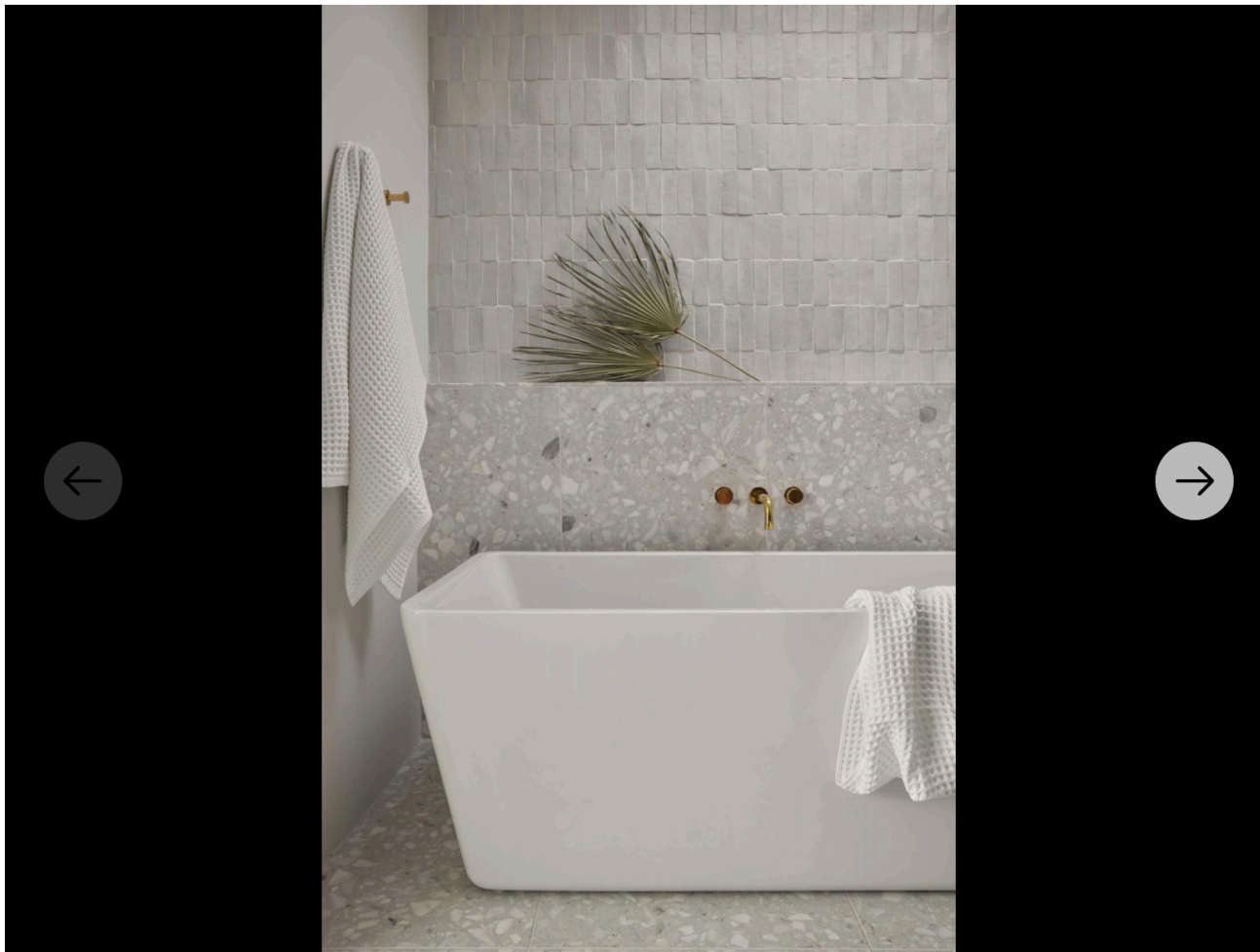
PHOTO 1 OF 5 Terrazzo marble tiles and textural zellige-tiled walls in the primary bathroom ensuite

Large format porcelain tiles that are extremely durable and cool underfoot spread across the open-concept living/dining/kitchen area and bedrooms; while fluted concrete tiles surrounded the walnut-panelled fireplace.