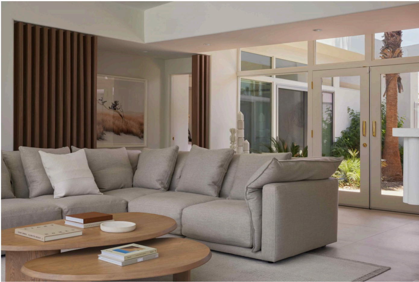
ABOVE Soft, parchment tones paired with consistent and muted walnut