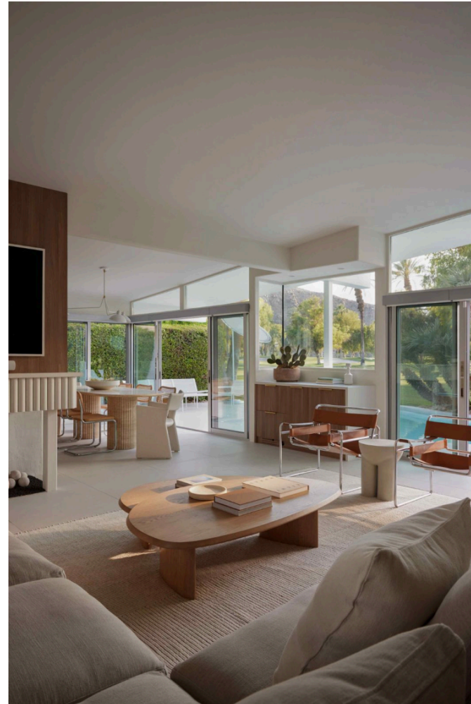
ABOVE Casa Sand Dune with a view of the sweeping golf course