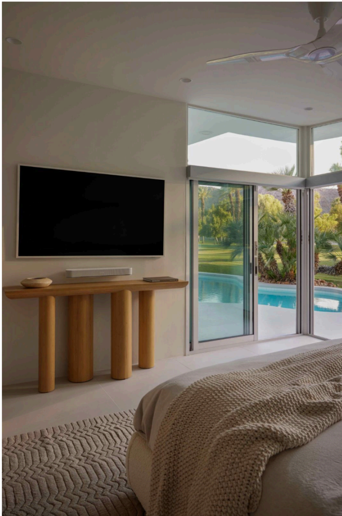
ABOVE The bedroom fireplaces were removed and replaced with built-in millwork

A subtle shift took place in the bathrooms, where soft terrazzo marble tiles and textural zellige-tiled walls were featured in the primary ensuite, and as a nod to retro design, off-white mosaic tiles encased the secondary bathrooms as a budget-friendly offset.