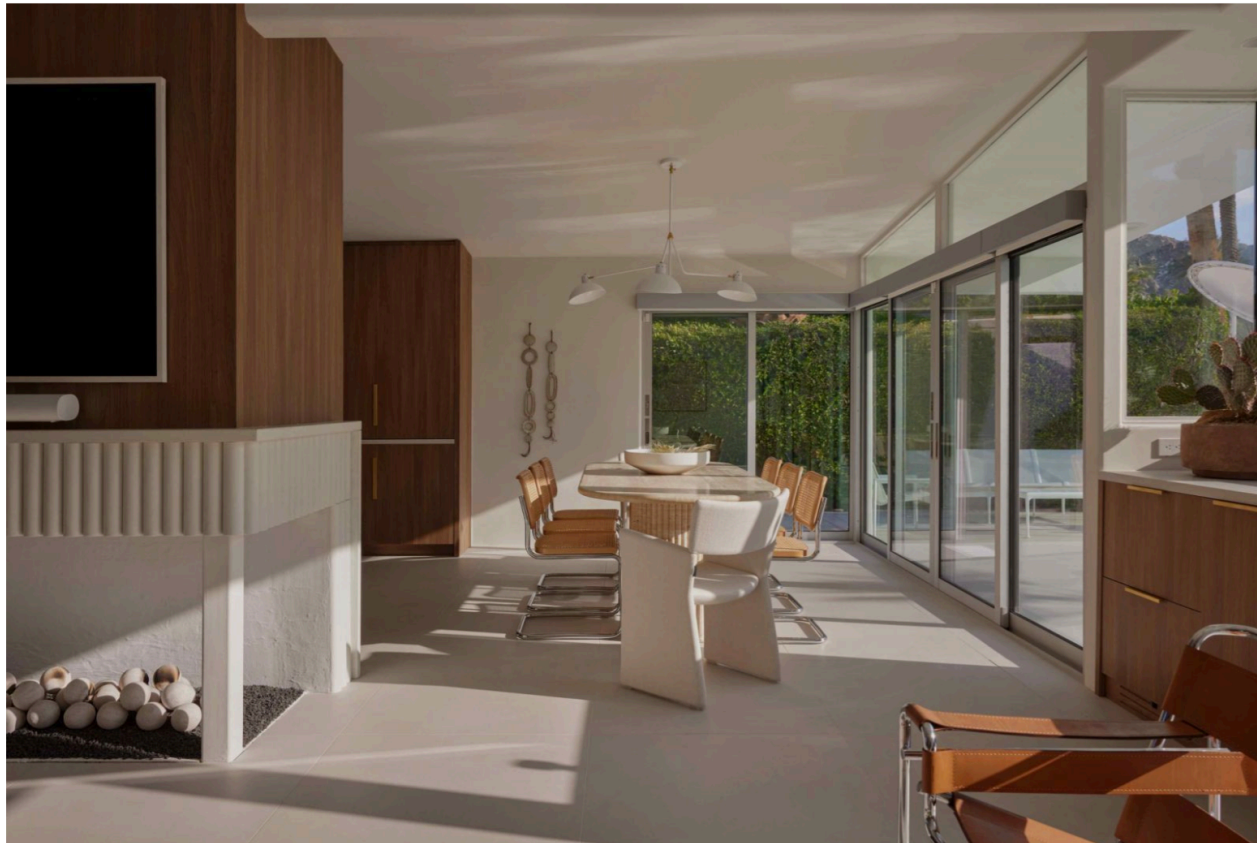
ABOVE Large format porcelain tiles that are extremely durable and cool underfoot

“Our client desired a soft, muted and organic palette that would be tonal and textural, and this aligned well with our taste and vision,” Brown explains. “We felt a neutral scheme would exude a sense of tranquillity and sophistication, resulting in a fresh take—a more calming and sophisticated approach—on the traditional mid-century style.”