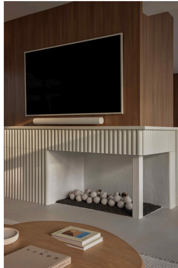
ABOVE Textural stone and warm woods