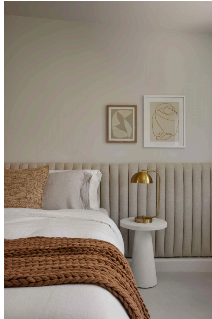
ABOVE The den was repurposed into a third bedroom with moveable twin beds