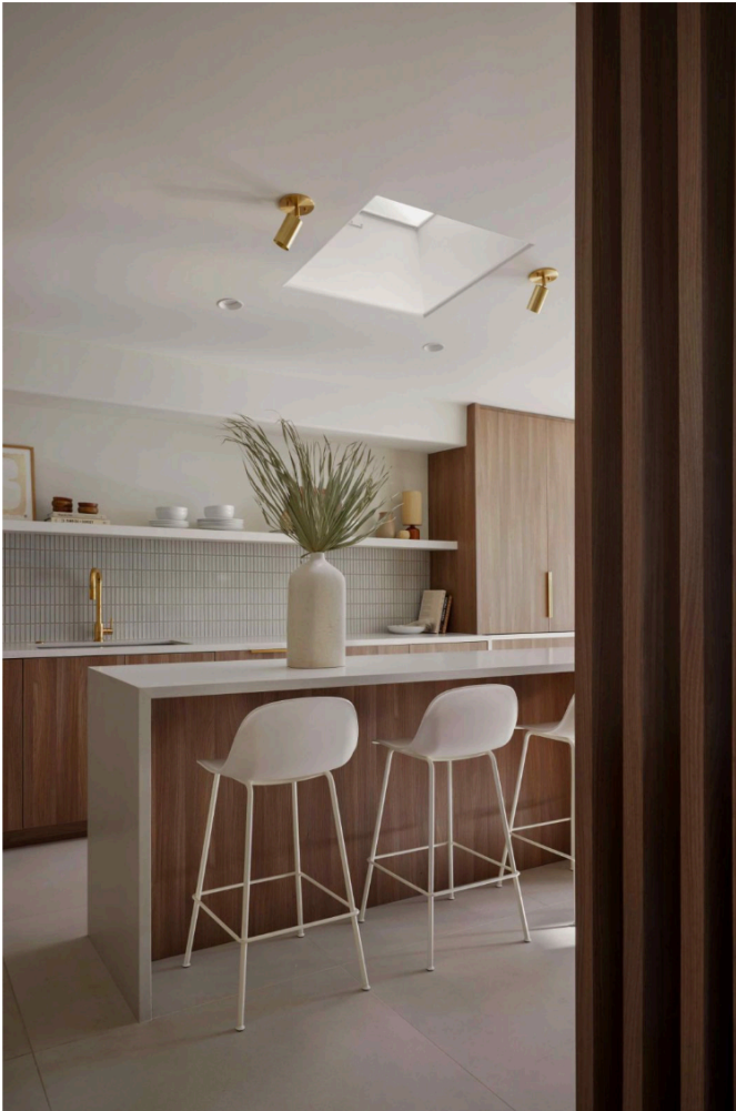
ABOVE The dated kitchen was reworked to incorporate a long island counter

However, Brown's team decided that the den was not a practical use of space, and thus repurposed it into a flexible third bedroom with twin beds that can be pushed together for a king-size. The bedroom fireplaces were also removed and replaced with built-in millwork .