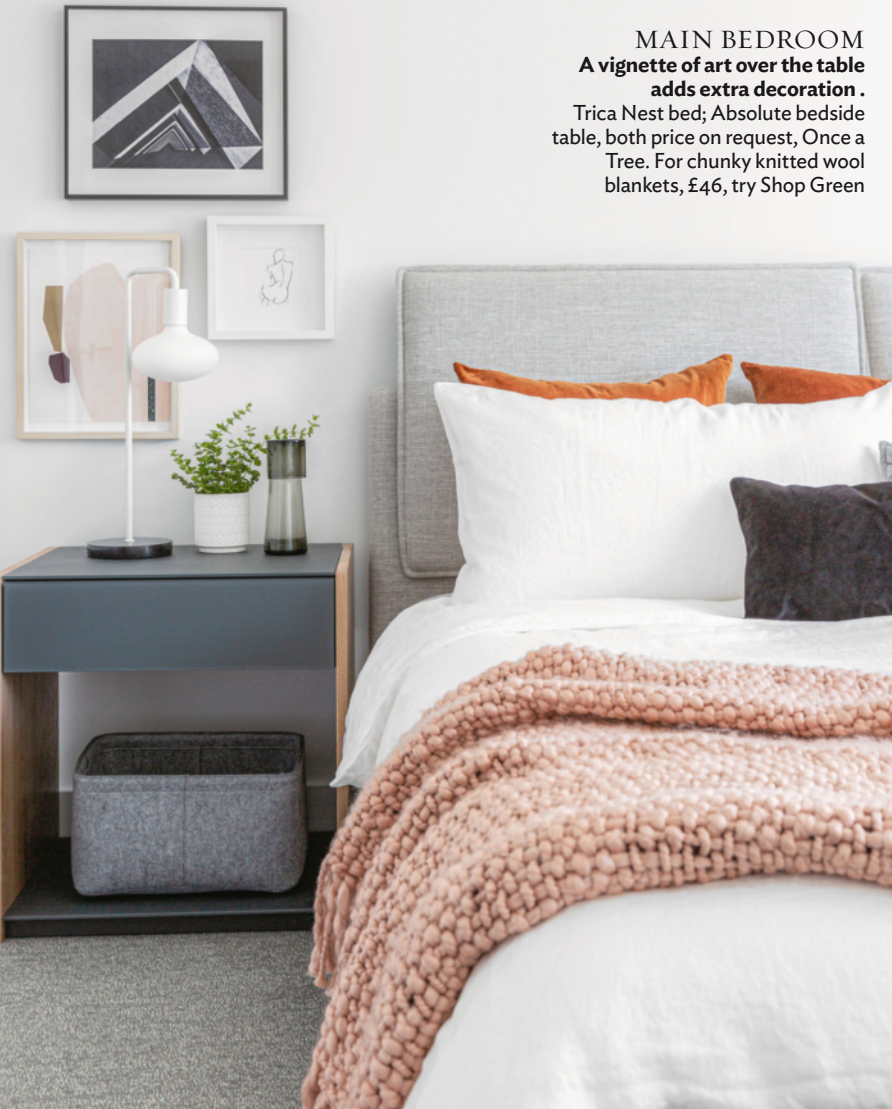
MAIN BEDROOM A vignette of art over the table adds extra decoration. Trica Nest bed; Absolute bedside table, both price on request, Once a Tree. For chunky knitted wool blankets, £46, try Shop Green