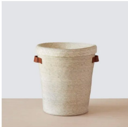
THE CITIZENRY Mercado Hamper $165