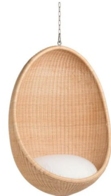
SIKA Design Nanna Ditzel Hanging Egg Chair $3223