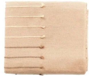
STUDIO VARIOUSLY Terra Merino and Cotton Throw $279