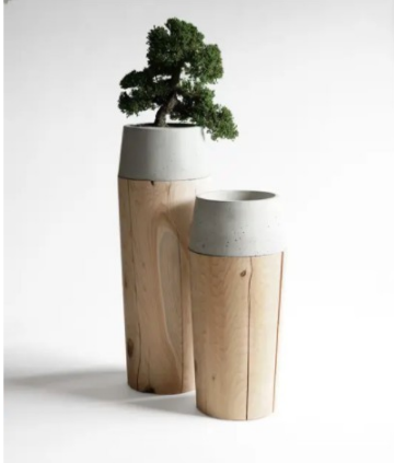
BARTER Revolve Planter $1050