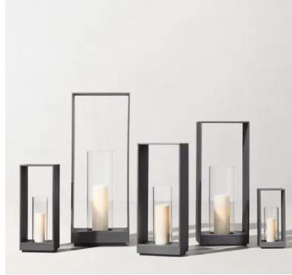
RH Toulon Lantern $175