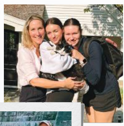
The family enjoying quality time.