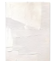
RELIEF [1] CANVAS PRINT BY ALYSSA HAMILTON ART, $110, SOCIETY6.COM