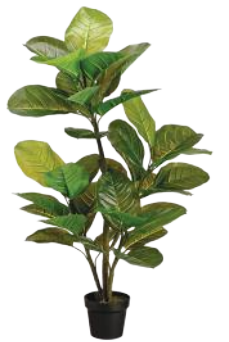
FAUX LARGE LEAF RUBBER PLANT, $100, WORLDMARKET.COM