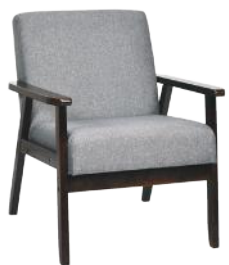
GRAY SOLID WOOD UPHOLSTERED ACCENT ARM CHAIR, $158, HOMEDEPOT.COM