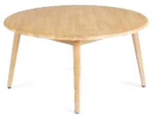
NIVOS TABLE, $249, ARTICLE.COM