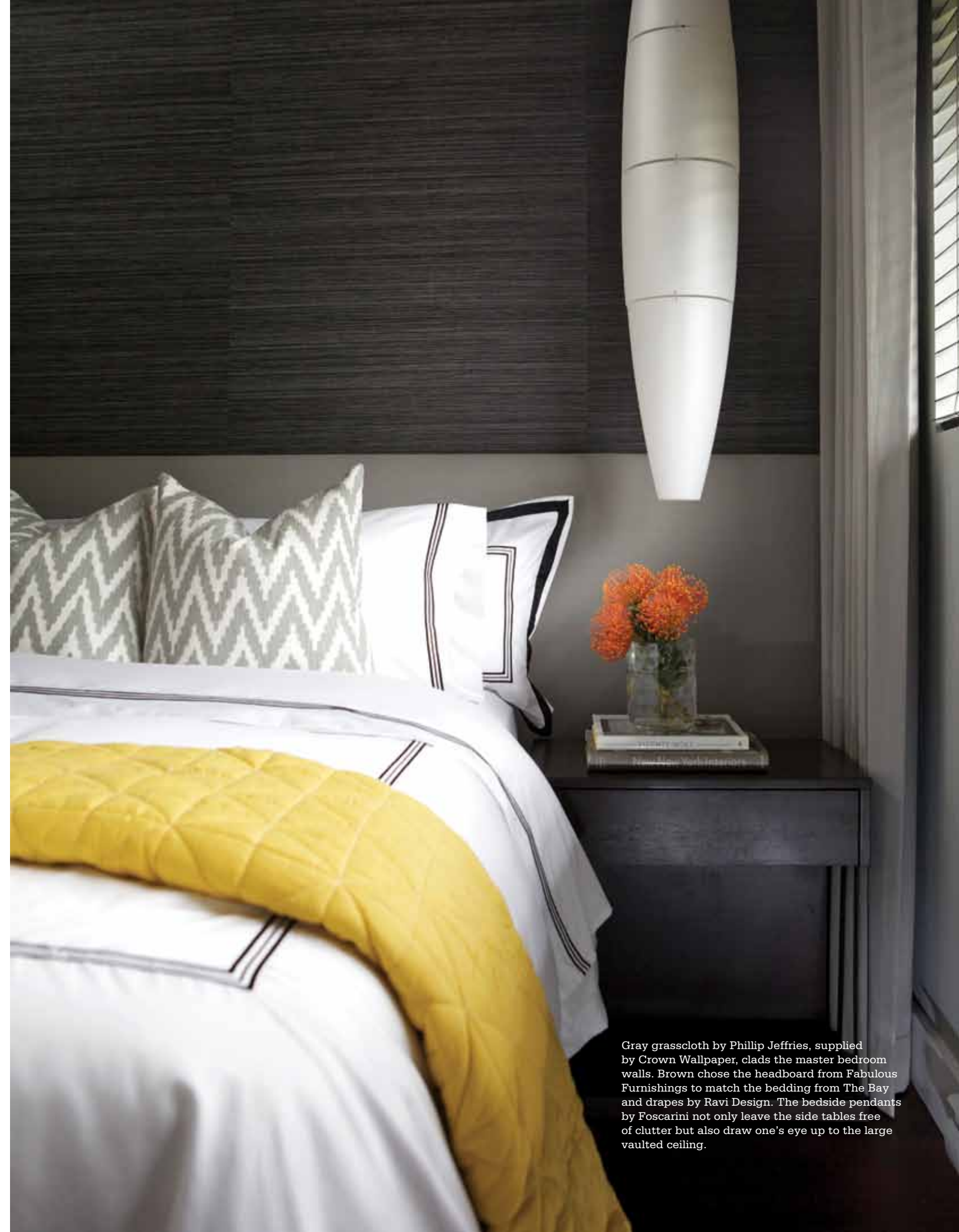
Gray grasscloth by Phillip Jeffries, supplied by Crown Wallpaper, clads the master bedroom walls. Brown chose the headboard from Fabulous Furnishings to match the bedding from The Bay and drapes by Ravi Design. The bedside pendants by Foscarini not only leave the side tables free of clutter but also draw one’s eye up to the large vaulted ceiling.

Both Stimac and Brown are thrilled with the final product, but that doesn’t mean the project is fully complete. What’s left to do? Stimac wants to add wiring to the massive outdoor pergola over his hot tub on the deck, which is nestled amid greenery. Why? “So I can watch hockey outside when it snows!” ❄️