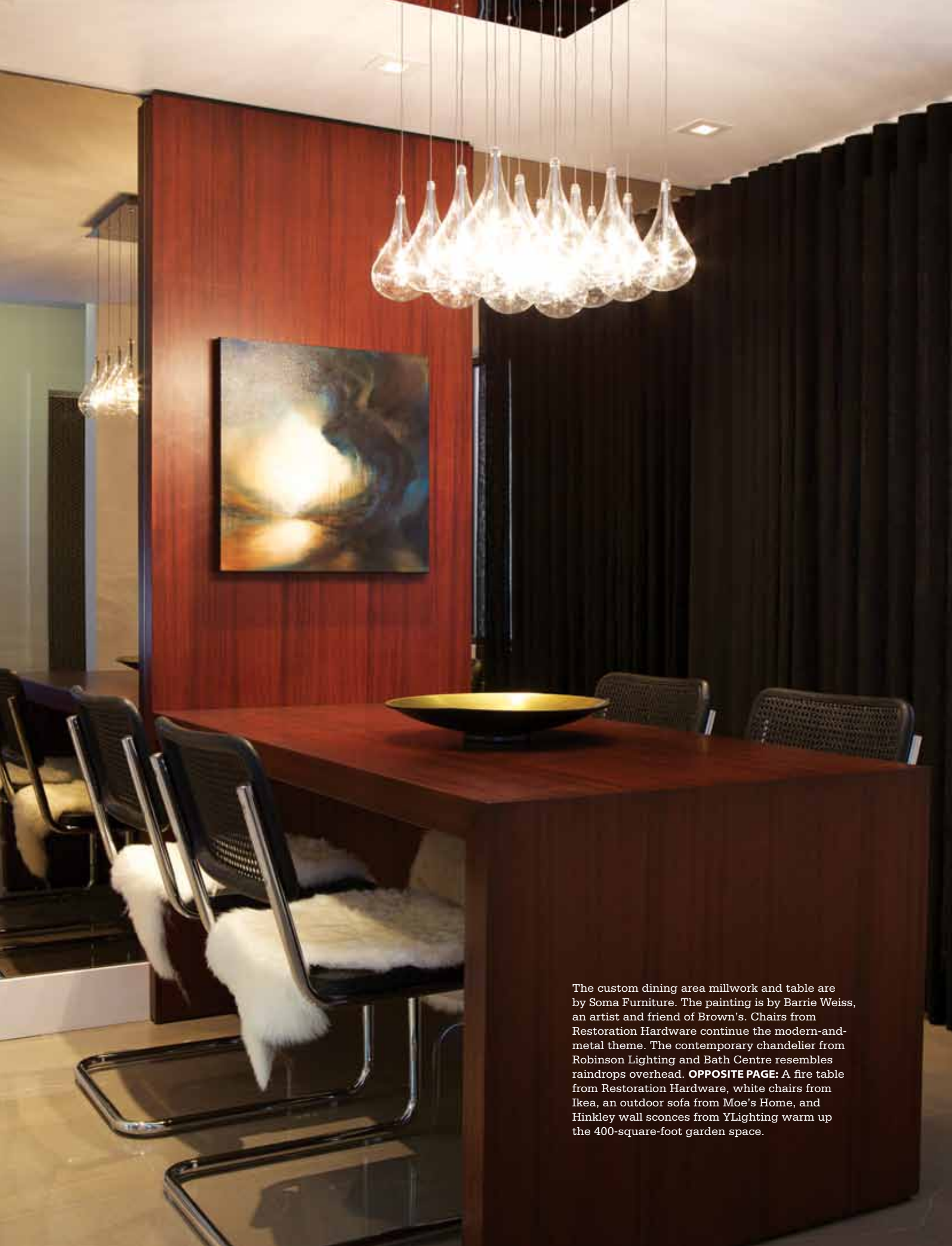
The custom dining area millwork and table are by Soma Furniture. The painting is by Barrie Weiss, an artist and friend of Brown's. Chairs from Restoration Hardware continue the modern-and-metal theme. The contemporary chandelier from Robinson Lighting and Bath Centre resembles raindrops overhead. OPPOSITE PAGE: A fire table from Restoration Hardware, white chairs from Ikea, an outdoor sofa from Moe's Home, and Hinkley wall sconces from YLighting warm up the 400-square-foot garden space.