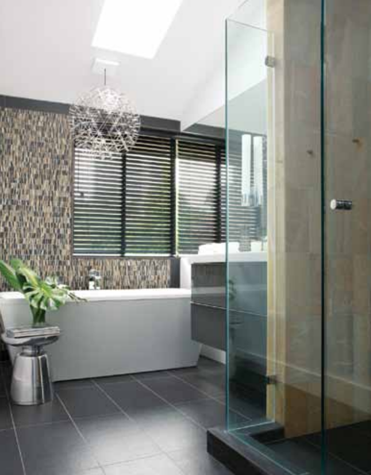
ABOVE: The upstairs bathroom features a pendant fixture by Moooi and a freestanding tub from Acrictec. All tile is from Creekside Tile. The gray floating Ikea vanity gives the illusion of more space. BELOW: In the downstairs powder room, Osbourne & Little wallpaper, supplied by AnneStarr, adds texture and drama to a small room.